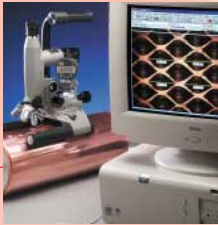
Automatic X-Y multiple cell measuring for gravure applications . . . features enhanced lighting, sharper images and more stable targeting