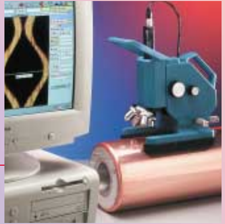
Plug n' Play PC based, automatic X-Y multiple cell measuring for gravure applications . . . features on-screen remote focusing and light adjustment