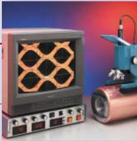
For Manual Measurement of Engraved Cells