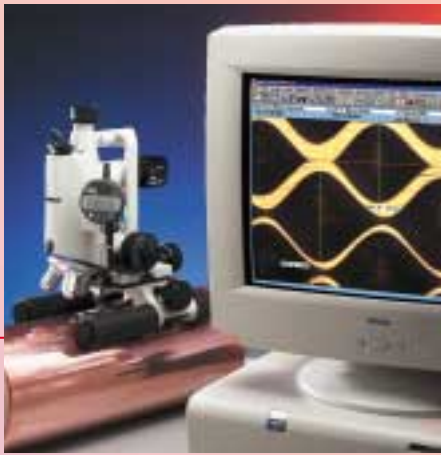
Automatic X-Y multiple cell measuring for gravure applications