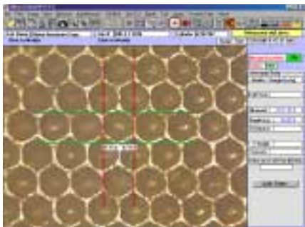
▲ Laser engraved cells on anilox roll